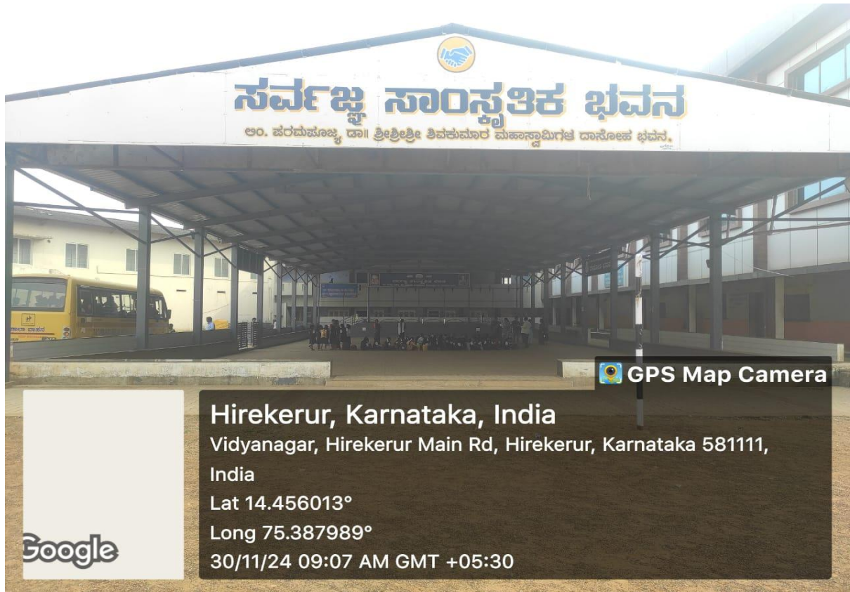
Sarvagna Outdoor Auditorium Hall