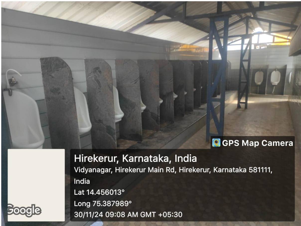
Another new toilet for Boys